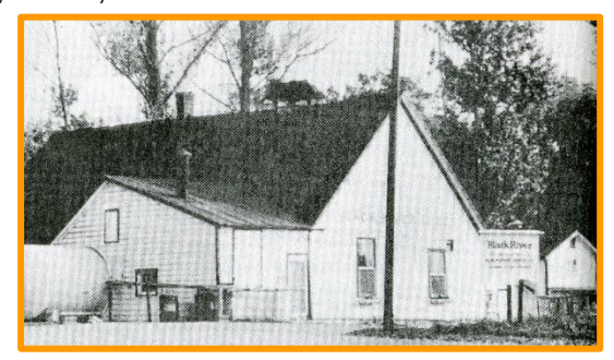
Black River Cheese Factory 1971

Cheese Factory and I responsible was for sales. At that time 90 lb. cheeses were made. waxed and aged until it was cut into thirds and a large cheese knife was used to cut whatever the customer asked for by weight. In later years, the cheese